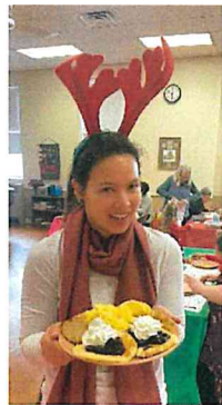
Breakfast with Santa